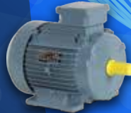
Motor Start / Run